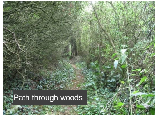
Path through woods

When you reach the main B5074 road, turn right and walk to the next road junction. Turn right and walk along the lane until the lane bears sharp right. Continue straight on along the edge of the field with the fence on your left. At the end of the field you reach a road. Cross the stile onto the road and turn right. Immediately after you pass Poole Old Hall on your right, cross the stile on your right and follow the path along the edge of the field with the hedge on your right.