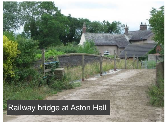
Railway bridge at Aston Hall

Go straight on and stay on the lane until you reach the T junction at the end. Take the footpath slightly to your left that goes straight on. It follows the edge of the field with the hedge on your left. You cross a stile by a gateway from which you can see Worleston Grange. Keep the hedge on your left and continue straight on. Climb a stile in the corner of the field and cross into woods. When we walked this route in July 2010 the woods were quite overgrown, but the path is still visible and walkable. Cross another stile and continue along the path until, at the next stile, you emerge onto a driveway. Turn left and walk down the drive to the road. This is the B5074 through Worleston. From here, turn left to reach the pub and shop in the village.