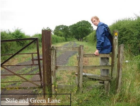
Stile and Green Lane

Brickyard Bridge over the canal. Cross the bridge and the stile at the end, then turn back to your left, cross another stile and descend the steps to the towpath. Turn left, so that you walk under Brickyard Bridge with the canal on your right. Follow the towpath under Jackson's Bridge, past Minshull Lock and on to Nanney's Bridge. Pass under the bridge and then climb the steps to the road. Turn left on the road and walk back to the entrance to Aqueduct Marina, 100 yards on the left.